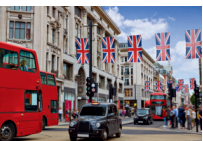
Oxford Street Shopping Explore one of the world's most famous shopping streets with countless shops, cafes, and restaurants.