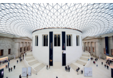
The British Museum Located nearby, this world-famous museum offers a wealth of history and culture.