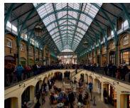
Soho and Covent Garden A vibrant area for dining, theatre, and nightlife, just a short walk away.