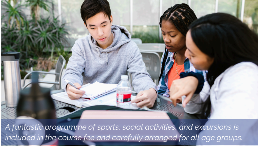
A fantastic programme of sports, social activities, and excursions is included in the course fee and carefully arranged for all age groups.