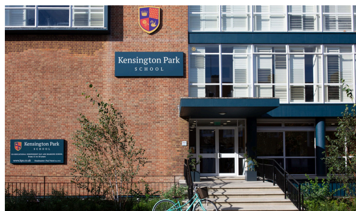
KENSINGTON PARK SCHOOL 40-44 Bark Place, London, W2 4AT

Perfectly positioned in central London, Kensington School combines the energy of city life with a welcoming and supportive environment, ensuring an unforgettable summer experience.